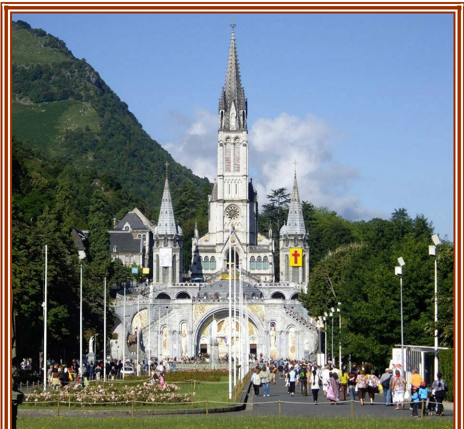
The basilica of Lourdes