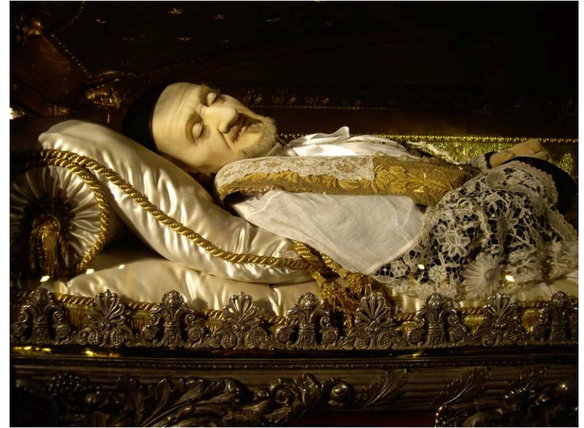
St. Vincent de Paul, the great apostle of charity